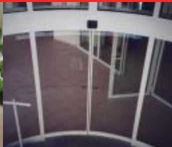
Sv. Anna Brno