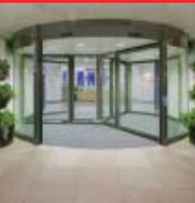
North Tees England