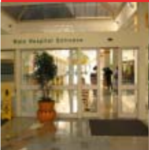
Main Hospital Durban

You can obtain our doors anywhere in the world. We are near at hand and would be happy to advise you personally.