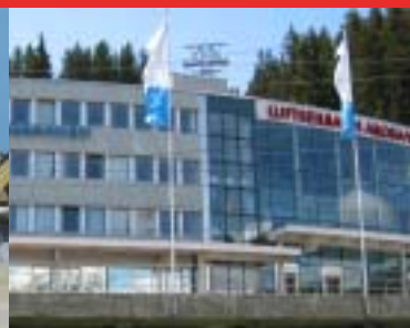
Mountain Railways Arosa