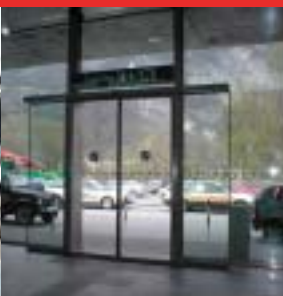
Railway Station Landeck